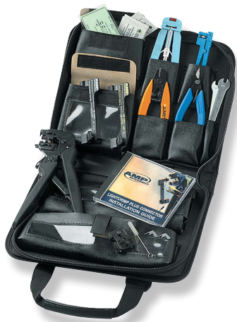
Deluxe Premise Termination Tool Kit